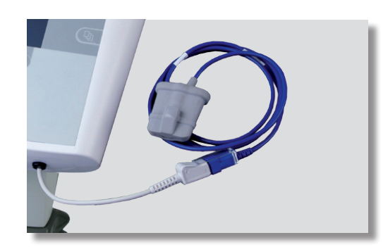
Oxygen saturation measurement (SpO<sub>2</sub>)