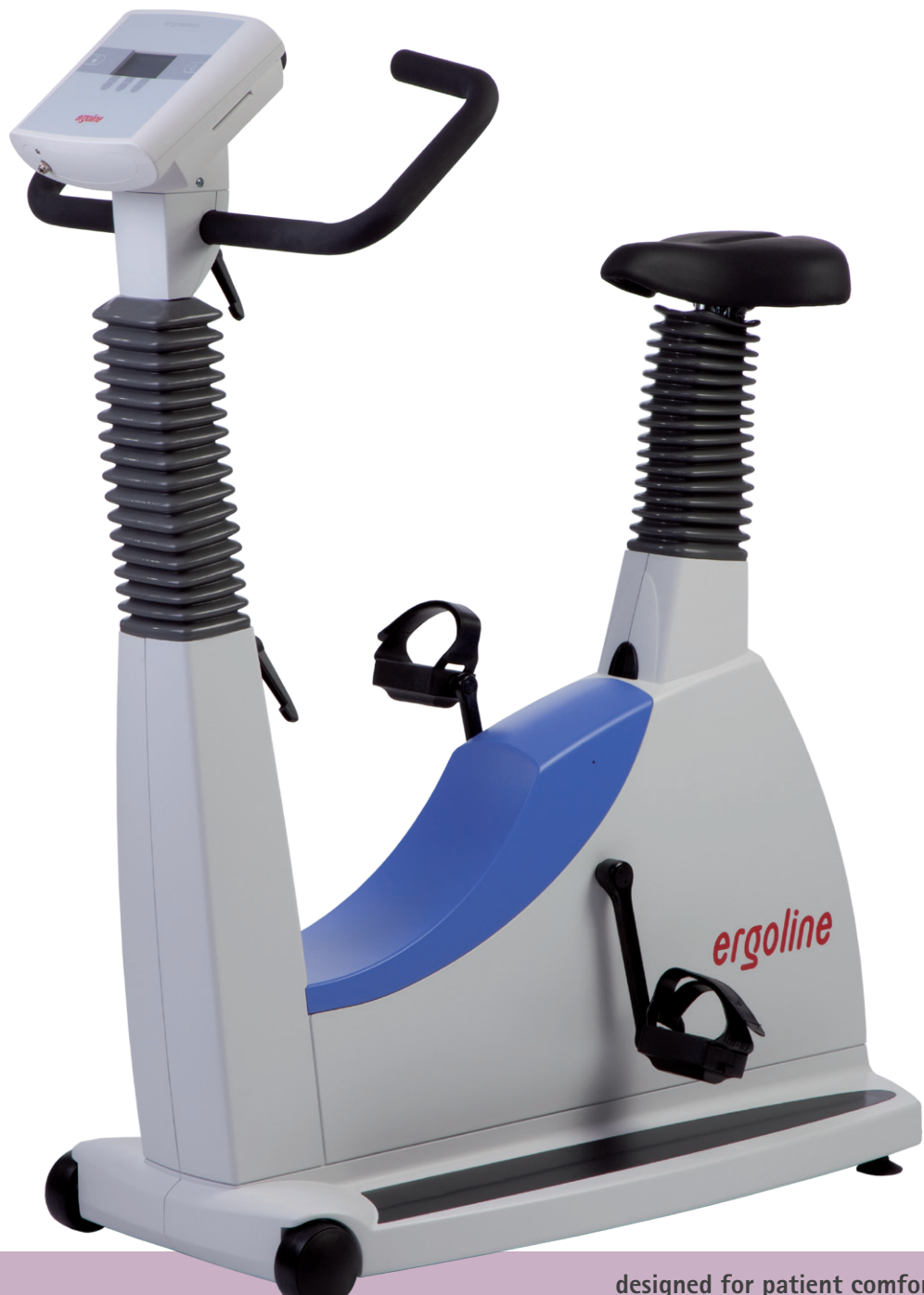
designed for patient comfort