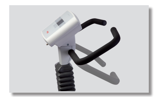
Continuously adjustable handlebar (angle)