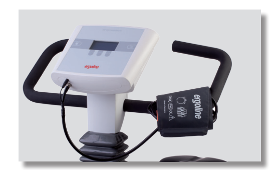
Automatic blood pressure measurement