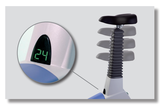
Motor-driven saddle height adjustment with height