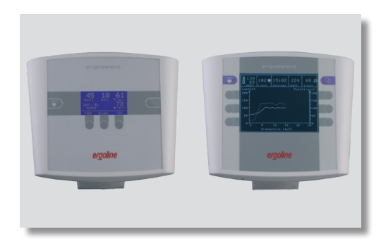
Different control units (P and K)