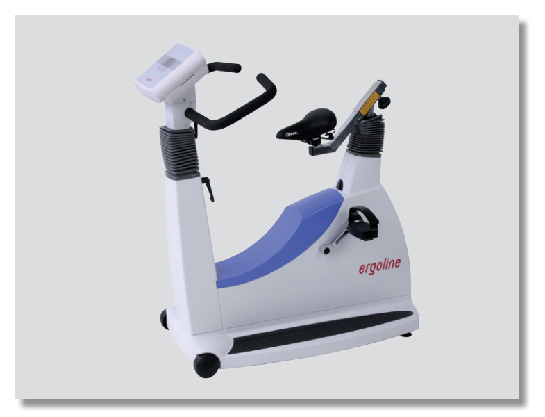
ergoselect 200 as pediatric ergometer