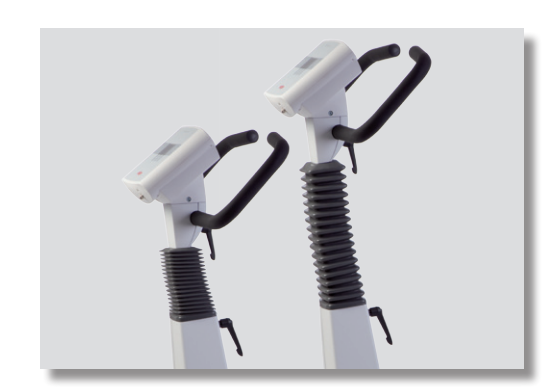
Continuously adjustable handlebar (height)