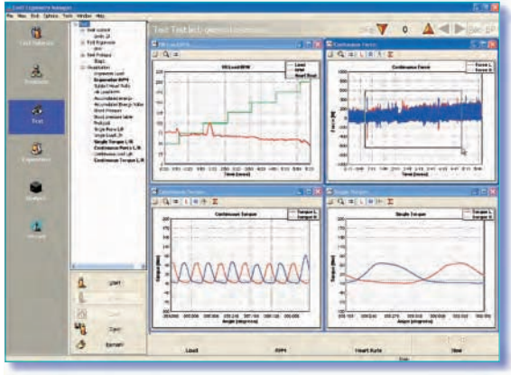
Define "area of interest"