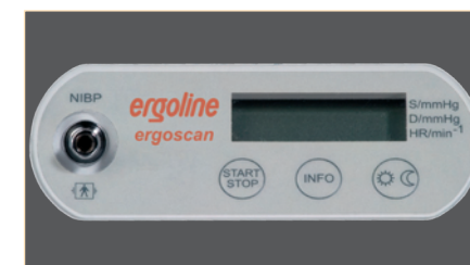
Thoughtfully designed control panel