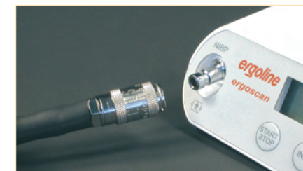
Metal cuff connector