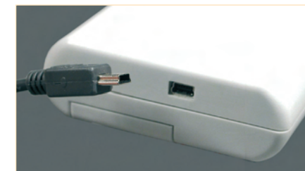
Reliable data transfer to PC