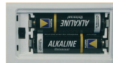
Operation with only 2 AA-size rechargeable batteries