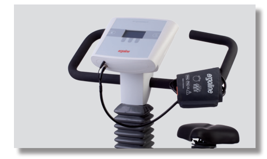
Automatic blood pressure measurement