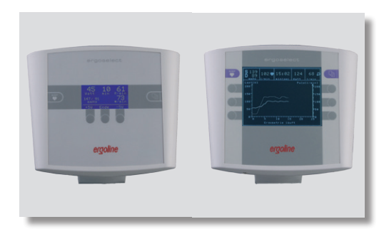
Different control units (P and K)