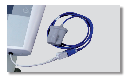
Oxygen saturation measurement