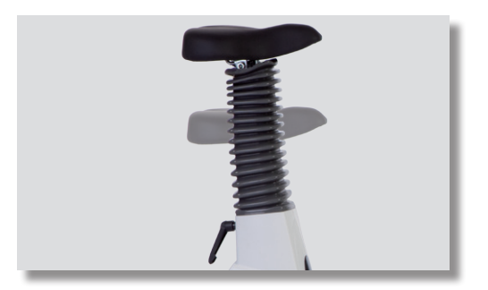
Continuously adjustable saddle height