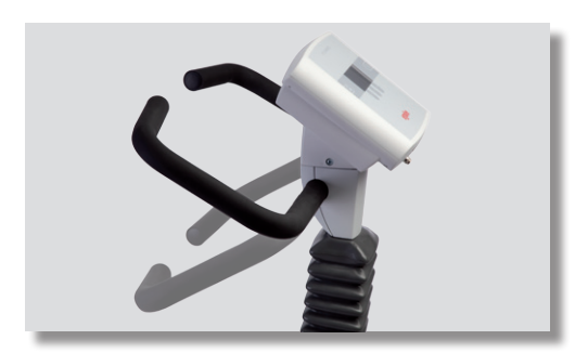
Continuously adjustable handlebar