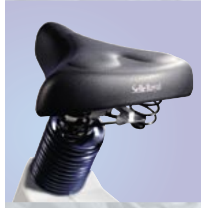
Comfortable gel seat with unique one-touch stepless adjustment.