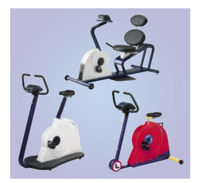
The Corival product line: Corival, Corival Recumbent and Corival Pediatric.

Thanks to Lode's many years of experience in production of medical ergometers and the continuous development to meet changing market demands, Lode is a flexible and reliable partner. In consultation with clients, specific ideas and requirements can be translated into a custom-made product. This has resulted in Lode also becoming a much requested supplier for various specialised ergometry projects. Before leaving the factory all Lode ergometers are dynamically calibrated and, of course, all units are produced under the strictest quality control conditions. Lode is ISO 9001:2000, ISO 13485:2003 and FDA certified and fulfils the EU Medical Device Directive MDD 93/42/EEC. Over years of use, service costs are almost negligible. In other words: Lode, the standard in Ergometry.