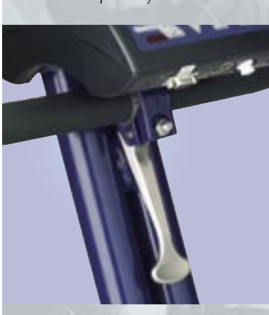
One-touch handlebar adjustment.