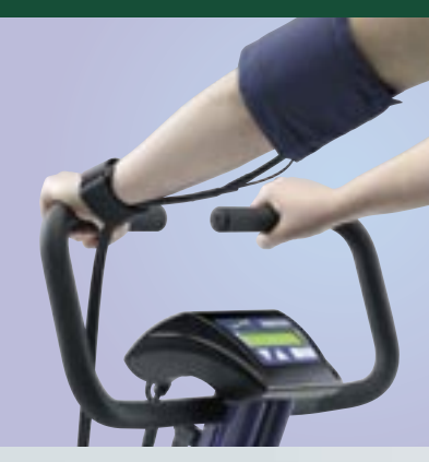
Accurate stress testing blood pressure

Horizontal saddle adjustment, extra large saddle, saddle with backsupport, arm support, writing tray, pedal shoes and pedal strap extension.