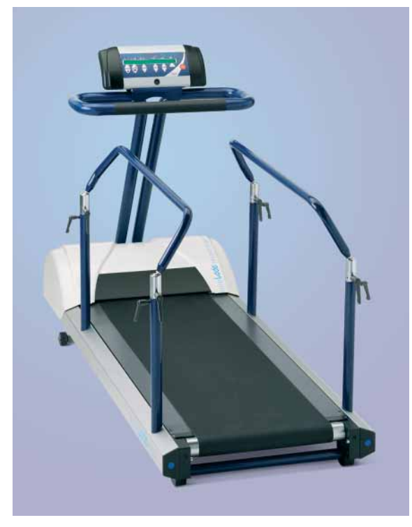
Valiant Rehab with optional adjustable side handrails

Before leaving the factory all Lode ergometers are dynamically calibrated and, of course, all units are produced under the strictest quality control conditions. Lode is ISO 9001:2000, ISO 13485:2003 and FDA certified and fulfils the EU Medical Device Directive MDD 93/42/EEC. Over years of use, service costs are almost negligible. In other words: Lode, the standard in Ergometry.