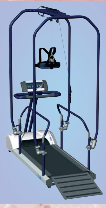
Valiant with optional safety belt and fall-stop